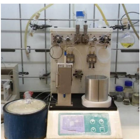
Scheme 2. Schematic representation of our flow set-up for the conversion of anilines to aryldiazonium tetrafluoroborates.